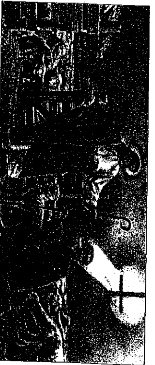
Our Lord gave Peter charge of His sheep and said that Peter would die for them too.